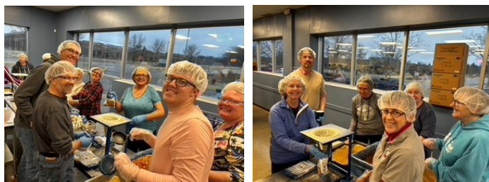
Feed My Starving Children Volunteers