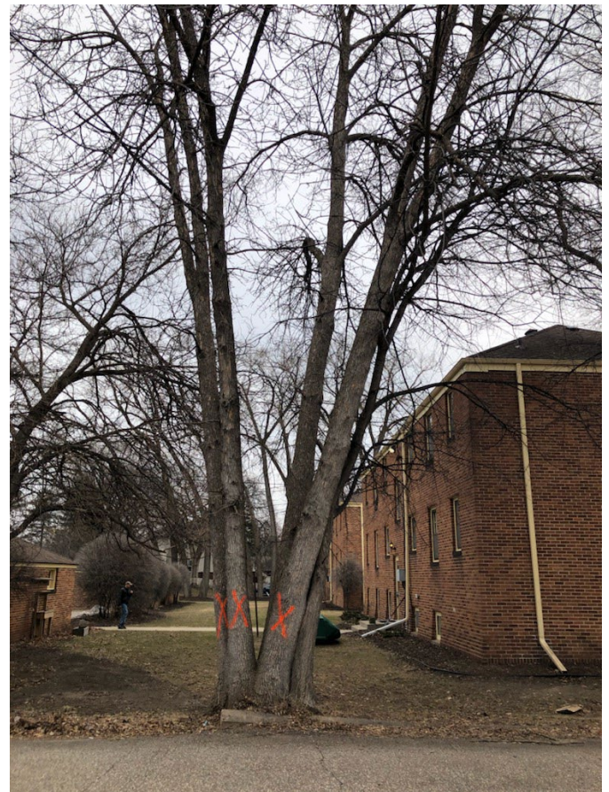
The ash tree at the edge of the parking lot was very tall and had five trunks.