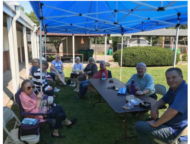
Friends gathered for lunch under the canopy.