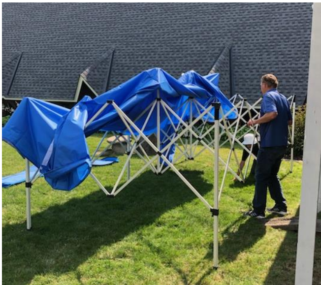
Bruce Wachutka and Bill Stromberg assembled the new canopy. The first week it took 20 minutes.

On the Thursdays in September, some of our parishioners gathered in the garden court under the new canopy for lunch in the shade. We brought our own lunch and beverage. If the weather holds, we look forward to continued lunches in the garden this fall.