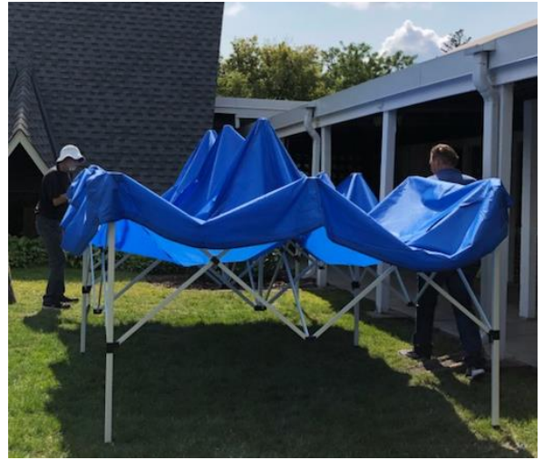
Okay, now we think we've got it figured out. The second week it took only 12 minutes.